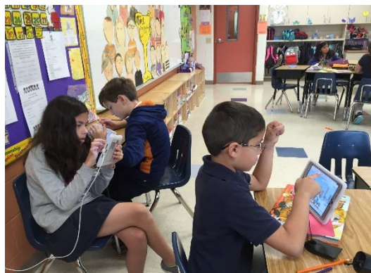
Students can use tablets to access Sumdog

Figure 2 shows the responses to the final three questions of the survey which investigate the class attitude towards math homework.